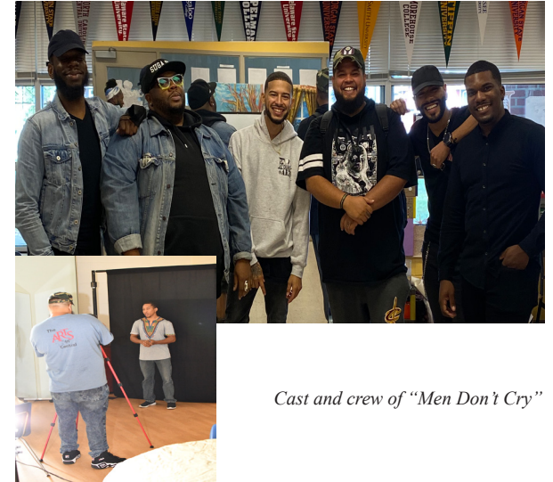
Cast and crew of "Men Don't Cry"

"Developing Minds and Creative Expression Through Engaging Arts Activities"