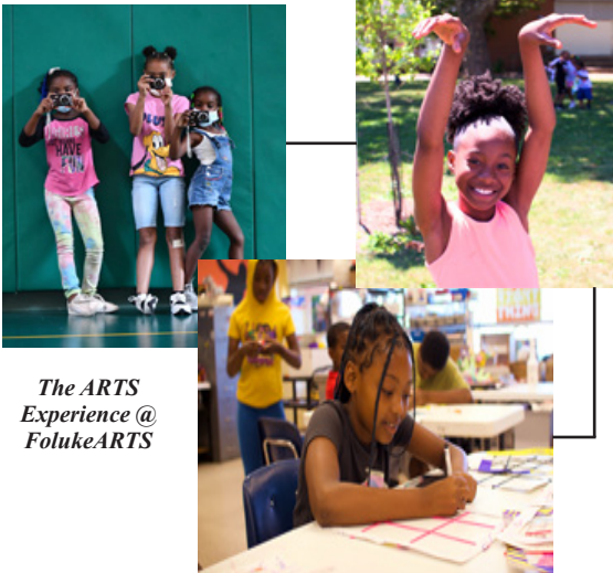
The ARTS Experience @ FolukeARTS

"The ARTS: One of the Most Valuable Tools for Building Relationships and Community